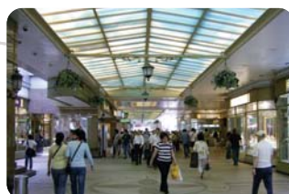
往行人天橋 To Footbridge