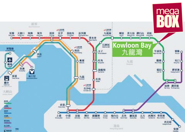
MTR System Map